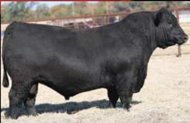
KLA Ring the Bell 310 - Lot 1, Reg: *20647125 Sire: *Janssen Dow Jones 0005 • MGS: *Poss Maverick EPDs: BW +2.3, WW +101, YW +165, MILK +35, CW +94, RE +1.11