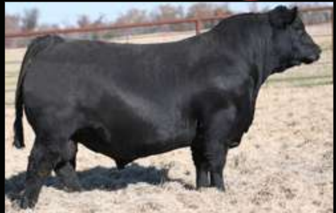
Penz Ralgro 2477 - Lot 5, Reg: *20705794 Sire: +*Deer Valley Growth Fund • MGS: #+*S A V Sensation 5615 EPDs: BW +.9, WW +65, YW +120, MILK +28, CW +55, RE +.47