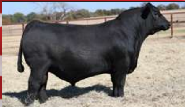
Penz Big Top 2520 - Lot 113, Reg: *20648148 Sire: Peak Dot Big Iron 30E • MGS: +*Penz Harvard 4676 EPDs: BW +3.3, WW +75, YW +133, MILK +19, CW +60, RE +.82