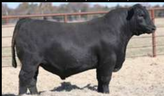
KLA Jonny Ringo 3120 - Lot 51, Reg: *20655340 Sire: +*S A V Jesse James 0968 • MGS: #+*Baldrige Colonel C251 EPDs: BW +4.1, WW +77, YW +135, MILK +22, CW +53, RE +.39