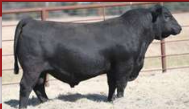
KLA The American 359 - Lot 22, Reg: *20646334 Sire: +*S A V Anthem 0042 • MGS: #+*S A V Renown 3439 EPDs: BW +3.4, WW +81, YW +128, MILK +18, CW +56, RE +1.08