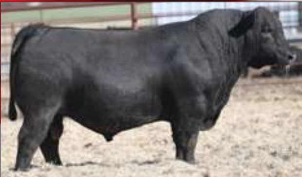
Penz Iconic 2445 - Lot 8, Reg: 20694383 Sire: *DB Iconic G95 • MGS: #*S A V Platinum 0010 EPDs: BW +0, WW +78, YW +120, MILK +24, CW +52, RE +.73