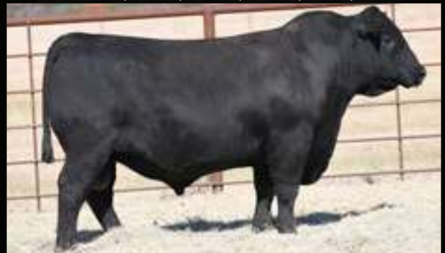
KLA Impower 365 - Lot 14, Reg: 20644498 Sire: *DB Iconic G95 • MGS: #+*S A V Regard 4863 EPDs: BW +3.3, WW +93, YW +160, MILK +31, CW +79, RE +.91