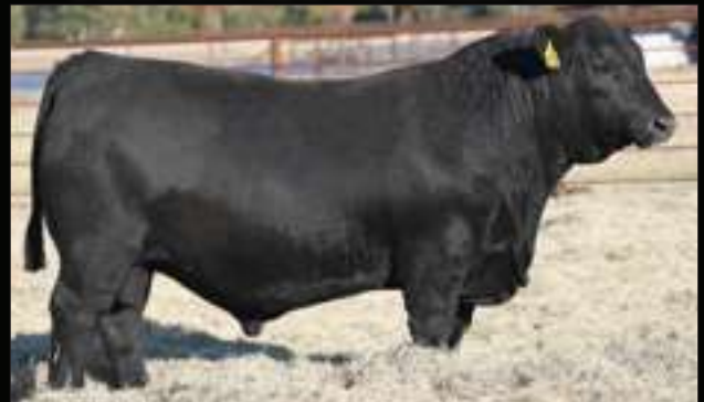
Penz Grand Canyon 2414 - Lot 68, Reg: *20705723 Sire: +*S A V Grand Canyon 0969 • MGS: +*S A V Impact 5595 EPDs: BW +1.7, WW +77, YW +137, MILK +39, CW +48, RE +.24