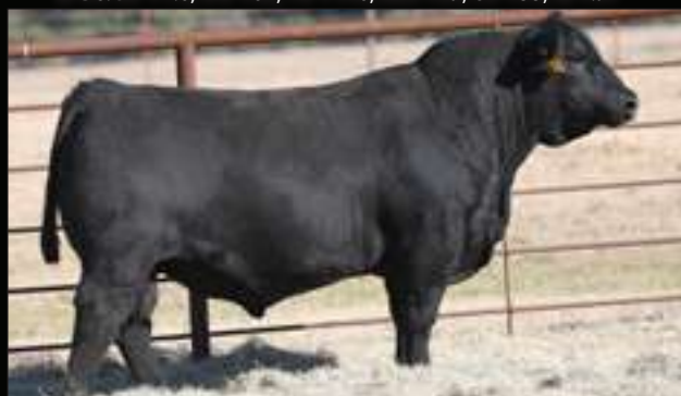
Penz Blue River 2522 - Lot 98, Reg: *20698240 Sire: *Ellingson Three Rivers 8062 • MGS: +*EXAR Endurance 3949B EPDs: BW +3.3, WW +85, YW +147, MILK +24, CW +69, RE +.95