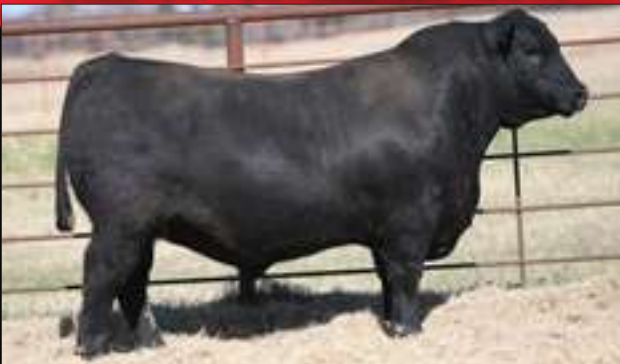
KLA Iceman 316 - Lot 11, Reg: *20644470 Sire: *DB Iconic G95 • MGS: #*S A V Platinum 0010 EPDs: BW +.3, WW +83, YW +134, MILK +35, CW +64, RE +.59