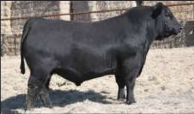
KLA Stock Ticker 321 - Lot 2, Reg: *20647124 Sire: *Janssen Dow Jones 0005 • MGS: +*E&B Plus One EPDs: BW +2.3, WW +84, YW +150, MILK +31, CW +66, RE +.83