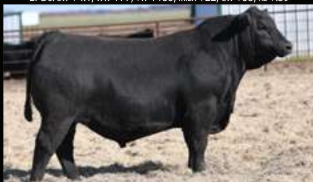
Penz Prevail 2496 - Lot 170, Reg: *20640951 Sire: *Penz Prevail • MGS: #+*S A V Renown 3439 EPDs: BW +4.2, WW +77, YW +141, MILK +14, CW +65, RE +.76