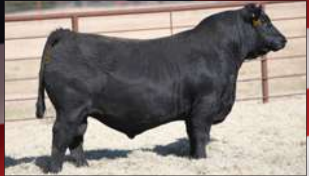
Penz Jesse James 2524 - Lot 50, Reg: *20698224 Sire: +*S A V Jesse James 0968 • MGS: +*EXAR Endurance 3949B EPDs: BW +.5, WW +60, YW +115, MILK +23, CW +36, RE +.32