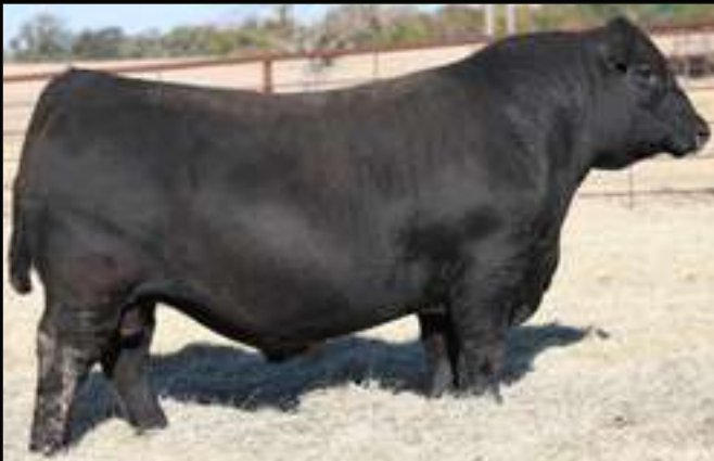
KLA Inferno 343 - Lot 17, Reg: *20644445 Sire: *DB Iconic G95 • MGS: +*KR Dollar EPDs: BW +2.0, WW +76, YW +135, MILK +30, CW +55, RE +.65