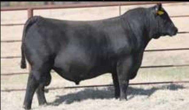
Penz Icon 2561 - Lot 20, Reg: 20694376 Sire: *DB Iconic G95 • MGS: #*S A V Final Answer 0035 EPDs: BW +1.7, WW +76, YW +126, MILK +35, CW +45, RE +.51