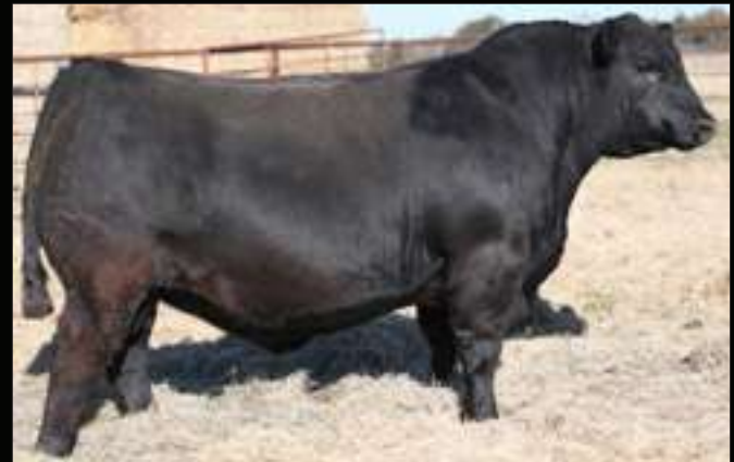
Penz Paragon 2469 - Lot 6, Reg: 20694380 Sire: *DB Iconic G95 • MGS: #*Connealy Western Cut EPDs: BW -.2, WW +70, YW +118, MILK +29, CW +41, RE +.81