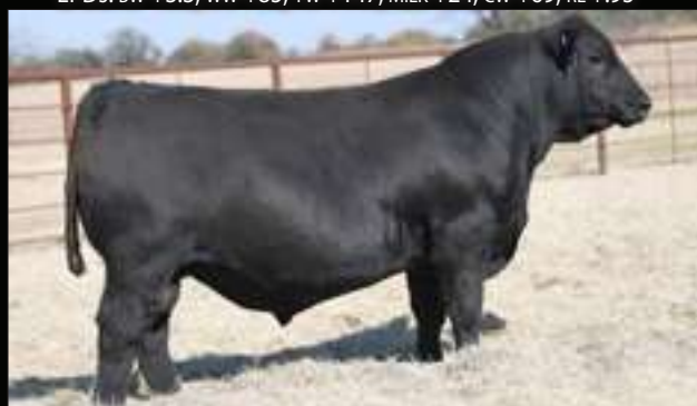
KLA Kayce 3177 - Lot 130, Reg: *20642587 Sire: +*Coleman Yellowstone 810 • MGS: #+*Baldrige Colonel C251 EPDs: BW +3.4, WW +86, YW +155, MILK +28, CW +57, RE +.28