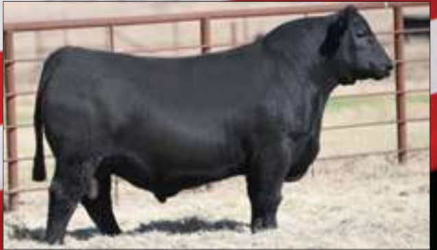
KLA Cross Fire 374 - Lot 64, Reg: *20627798 Sire: *S A V Checkmate 8158 • MGS: #*S A V International 2020 EPDs: BW +.9, WW +69, YW +118, MILK +25, CW +29, RE +.53